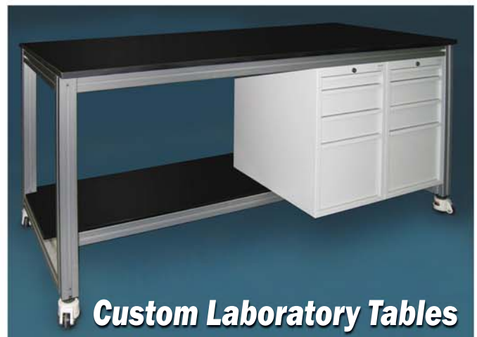
Custom Laboratory Tables