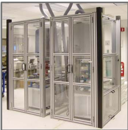
Walk-in hoods provide huge savings over dedicated rooms with special ventilation.