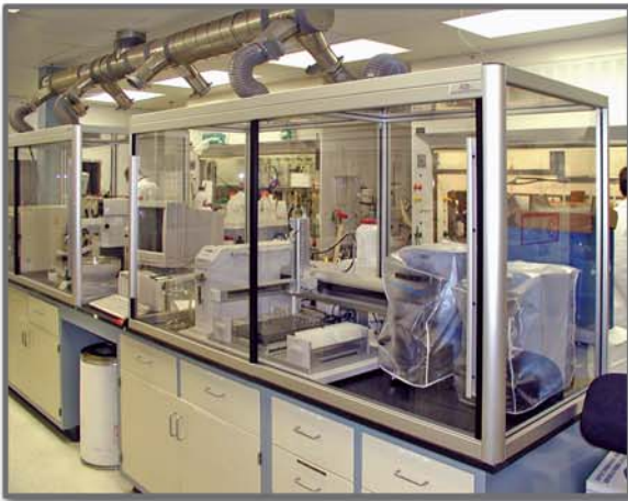
Choose from a wide range of door options.