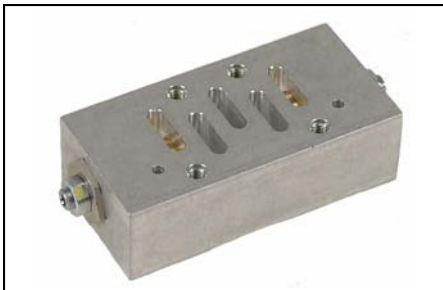
Available for all sizes. Adjust via screw on each side.