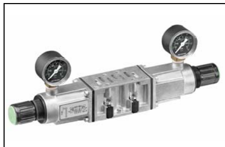
Available for sizes 1 through 3. Provides two separate delivery pressures.