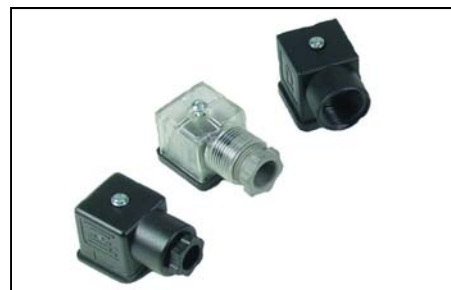
Full line of 1/2" conduit and strain relief connectors for all valve sizes. Lighted and non-lighted versions