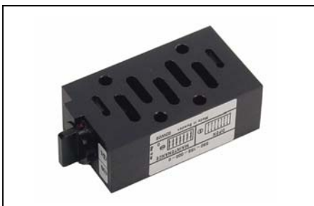
Available for sizes 1 through 3. Allows servicing of an individual valve in a manifold system