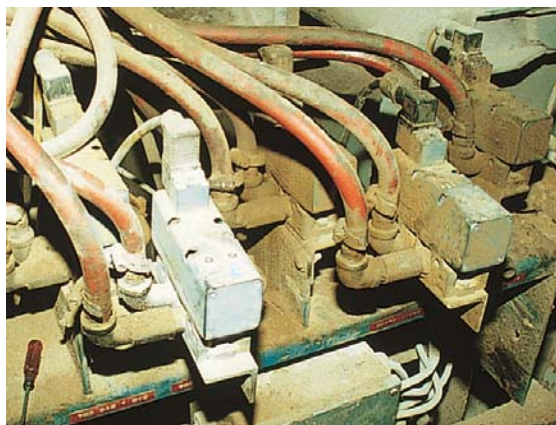
Concrete batching plant application. Ceram valves withstand harsh conditions and dirty air without "sticking".

Specified by industries that demand tough valves due to their harsh operating environment. Ceram™ valves are very prevalent where ordinary valves just don't last. Industries such as: tire plants, foundries, paper mills, steel plants, concrete batch plants, sawmills, plywood and board plants, automotive assembly, rubber and plastics glass manufacturers, smelting, sheet metal fabrication, etc.