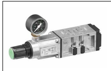
Available for sizes 1 through 3. Knob can lock in a given position.