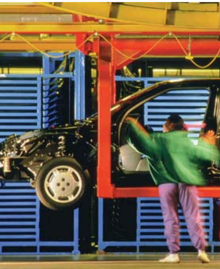
Systems and component solutions for automobile production