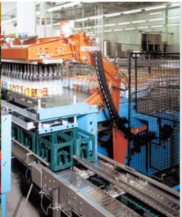
Systems and components for Packaging machines/equipment