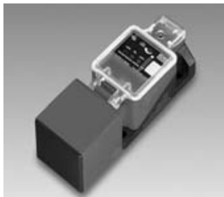
41.5 x 41.5 x 120 extended sensing distance