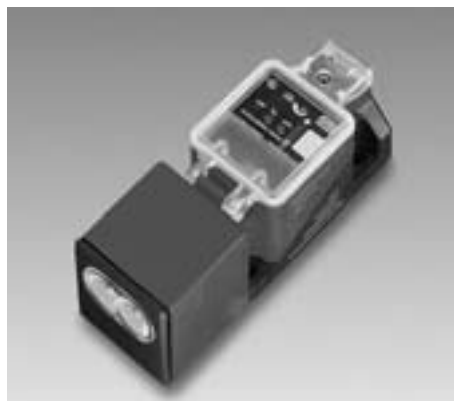
120 x 41.5 x 41.5 mm

OR17 RT-DPTP- 02.0-AGEC 655.7860.002 272/4 ●/-