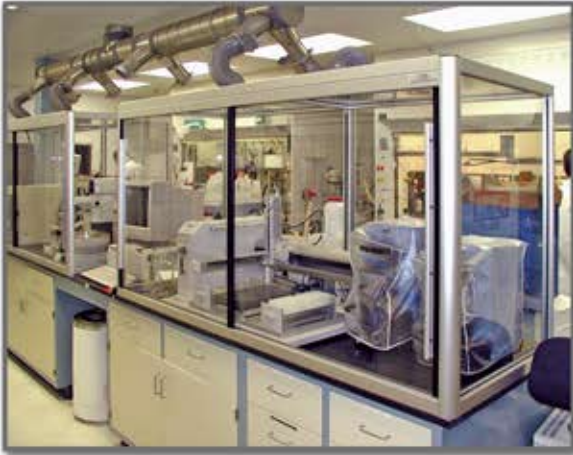
Choose from a wide range of door options.