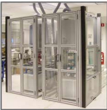
Walk-in hoods provide huge savings over dedicated rooms with special ventilation.