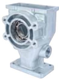
FlowMaster II crankcase