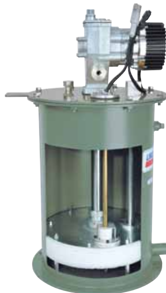
FlowMaster pump and reservoir with 2" (50.8 mm) foam follower and level sensor

Special follower plate [also available in 2 in. (50.8 mm) foam version]